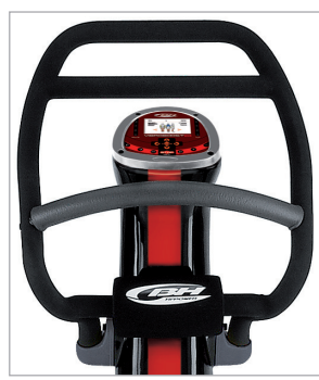
MULTIPOSITION HYPOALLERGENIC HANDLEBAR