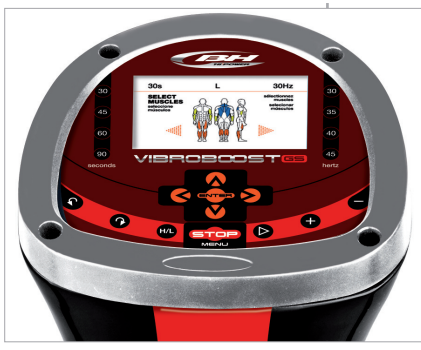
VIBROBOOST MONITOR WITH GRAPHICS DISPLAY

Install the latest fitness trend in your fitness area for a minimum outlay.