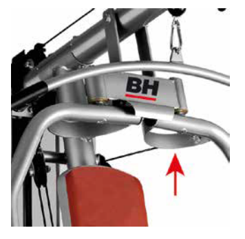
USE OF CAMS These profiles help an ergonomic exercise attended.

Max. user weight: 100kg Weight: 112kg Dimensions: 138cm x 92cm x 207cm Max. dynamic tension / load: 70kg