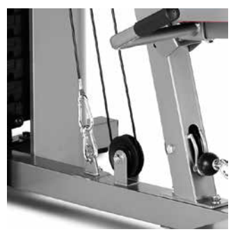
PULLEYS SYSTEM The bearings pulley system provides smooth and direct exercise.